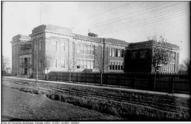
Bedford Park Public School, 1920s