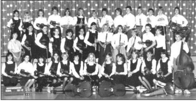
Bedford Park PS Band, 1981