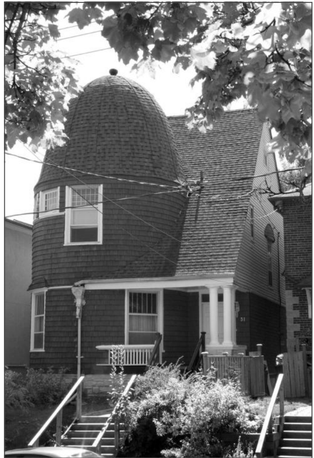
31 Bedford Park

North Toronto's oldest surviving building is the lovely Snyder House, 744 Duplex Avenue (1828, enlarged 1865). A more unusual house is at 31 Bedford Park Avenue. Clad in wood shingles, its large rounded tower is unique. Another striking house is Treetops at 21 Deloraine Avenue (built 1905). This grand home is now a small private school for children with learning disabilities. During World War I it was associated with the pilot training at North Toronto Flying Station (Armour Heights).