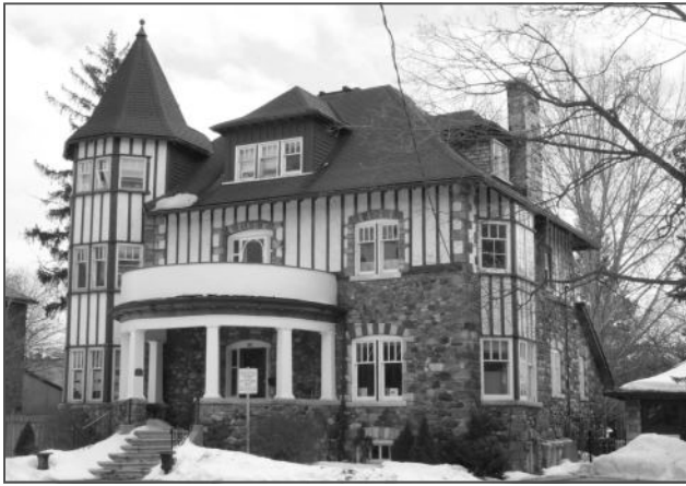
Treetops, 21 Deloraine Ave.

After 1905, North Toronto's population increased by 500 annually for four years. Many residents went into Toronto for work and entertainment, and wanted the amenities that the Town of 6,000 could not afford. When Toronto annexed the Town in 1912, none of North Toronto's streets were paved and the water supply was inadequate.