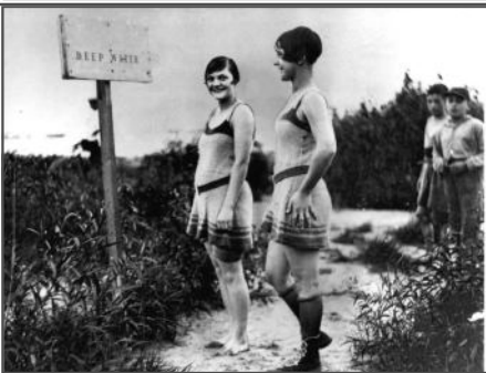
Foot of Bathurst St., 1920s CTA