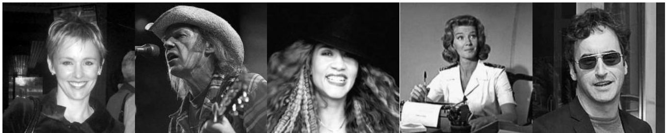
Notable LPCI alumni include Wendy Mesley, Neil Young, Amanda Marshall, Lois Maxwell, Don McKellar.