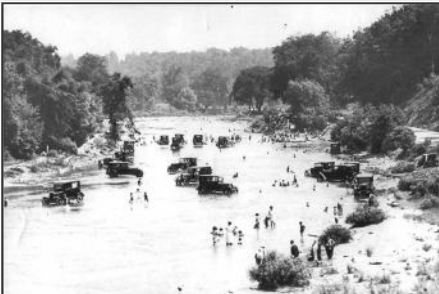
Bathers & car washers, Humber River, 1920s