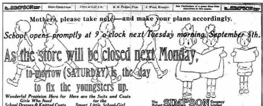
Toronto Star, 1 Sept 1911