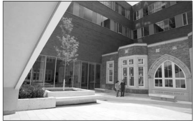
North Toronto C.I. Heritage Courtyard Marta O'Brien

North Toronto has many schools. The private Greenwood College School occupies a renovated 1950s office building and other structures at Mount Pleasant and Davisville. Its 350 students enjoy a central atrium with a climbing wall connecting all three floors. In 2010, North Toronto Collegiate Institute left a building with parts dating to 1912 to move into an exciting new structure. The courtyard of the new school incorporates portions of the original.